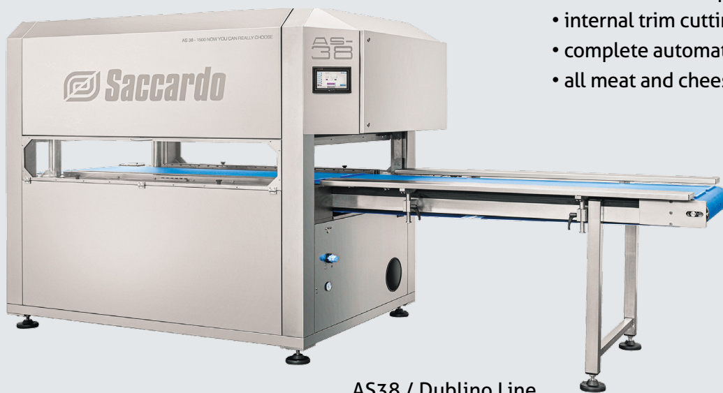
AS38 / Dublino Line